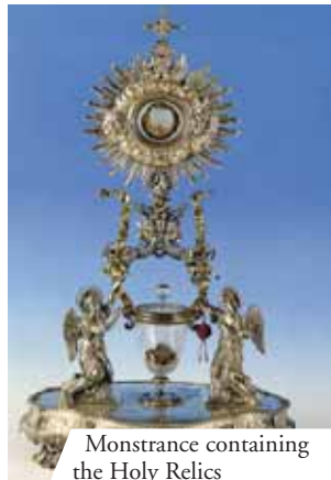
Monstrance containing the Holy Relics

An inscription in marble from the 17th century describes this Eucharistic miracle which occurred at Lanciano in 750 at the Church of St. Francis. “A monastic priest doubted whether the Body of Our Lord was truly present in the consecrated Host. He celebrated Mass and when he said the words of consecration, he saw the host turn into Flesh and the wine turn into Blood. Everything was visible to those in attendance. The Flesh is still intact and the Blood is divided into five unequal parts which together have the exact same weight as each one does separately.