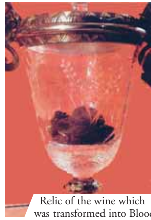
Relic of the wine which was transformed into Blood