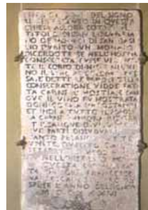
Stone tablet from 1631 which describes the miracle